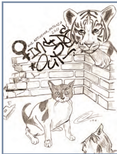
Image developed for the Ontario Think Tank by Tia, one of the 'inside' students from the GVI/WLU Inside-Out class.

This program is a gift to all those who strive for social justice from very real places in their hearts. Each woman in Inside-Out brings a lifetime of