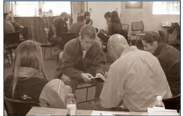
In small groups, participants in the writing workshop share their personal stories of causing, witnessing, and responding to harm.

– ACE Think Tank and Inside-Out alumni of Oregon