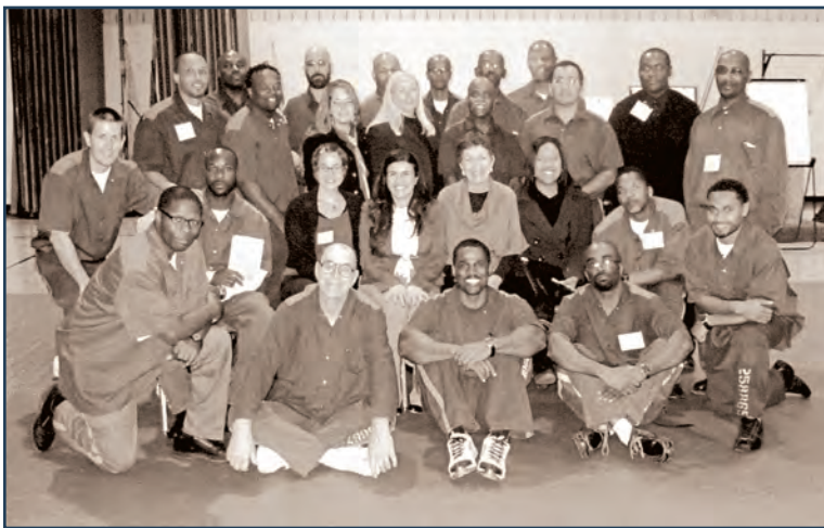
The Theory Group at Ryan Correctional Facility, Michigan's Think Tank.

about the HUB's function and direction. We decided collectively to continue meeting; the next meeting will be held at the University of Toledo in the spring. Thus far, our purpose is to provide support for instructors while trying to grow the program in new locations. Rather than predetermining the way the group should function, we decided to allow it to grow organically, in order to best meet the needs of its members.