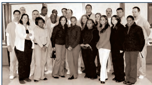
A class of students from UMass Dartmouth and the Bristol County HOC, studying Crime, Justice, & Policy.