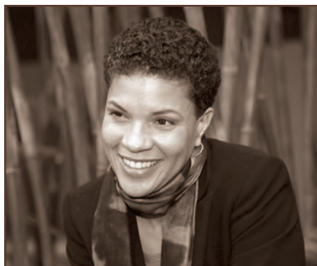
Michelle Alexander is the author of The New Jim Crow: Mass Incarceration in the Age of Colorblindness .

As a young lawyer working for the ACLU, she met, unexpectedly, a young African-American man who had been accused of selling drugs. Due to his appearance and eloquence, the ACLU immediately identified him as a perfect candidate to fight for, which is in conformity with the usual practice of representing ideal prospects less susceptible to ad hominem attacks. He shared with her a detailed